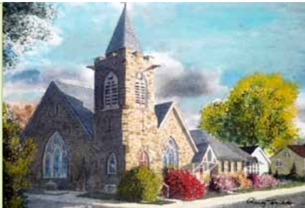
Newtown United Methodist Church